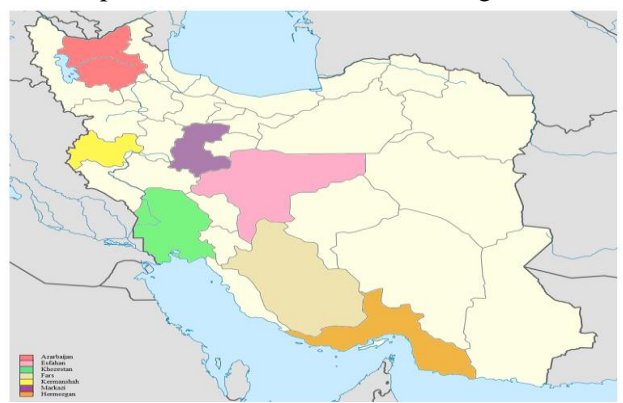
Fig 1. Locating the Provinces

Taxation on petroleum products imposed on seven provinces in Iran. The distribution of these provinces shown in the following illustration: